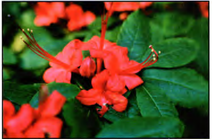
Brilliant scarlet of R. prunifolium , the Plum Leaf Azalea, loved by hummingbirds