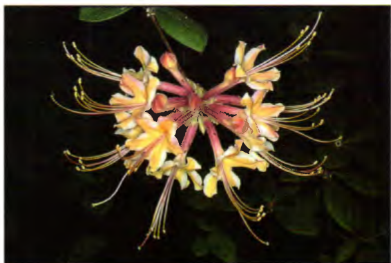
Photo 1. Rhododendron hybrid 'Millie Mac' in typical coloration.

The normal flower coloration of 'Millie Mac' (Photo 1.) is yellow axially along each lobe, with white margins on the lateral edges. On the aberrant inflorescence (Photo 2.), the lobes are white, except for the yellow blotch on the upper lobe. The two pictured inflorescences were on two forks of a single branch.