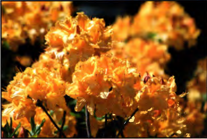
Wonderful colors result when a native species — Oconee Azalea — crosses with an Exbury hybrid: Rhododendron flammeum x 'Marion Merriman'.

Here are some samples of hundreds of the color forms and ranges possible in the landscape when using deciduous native azaleas.