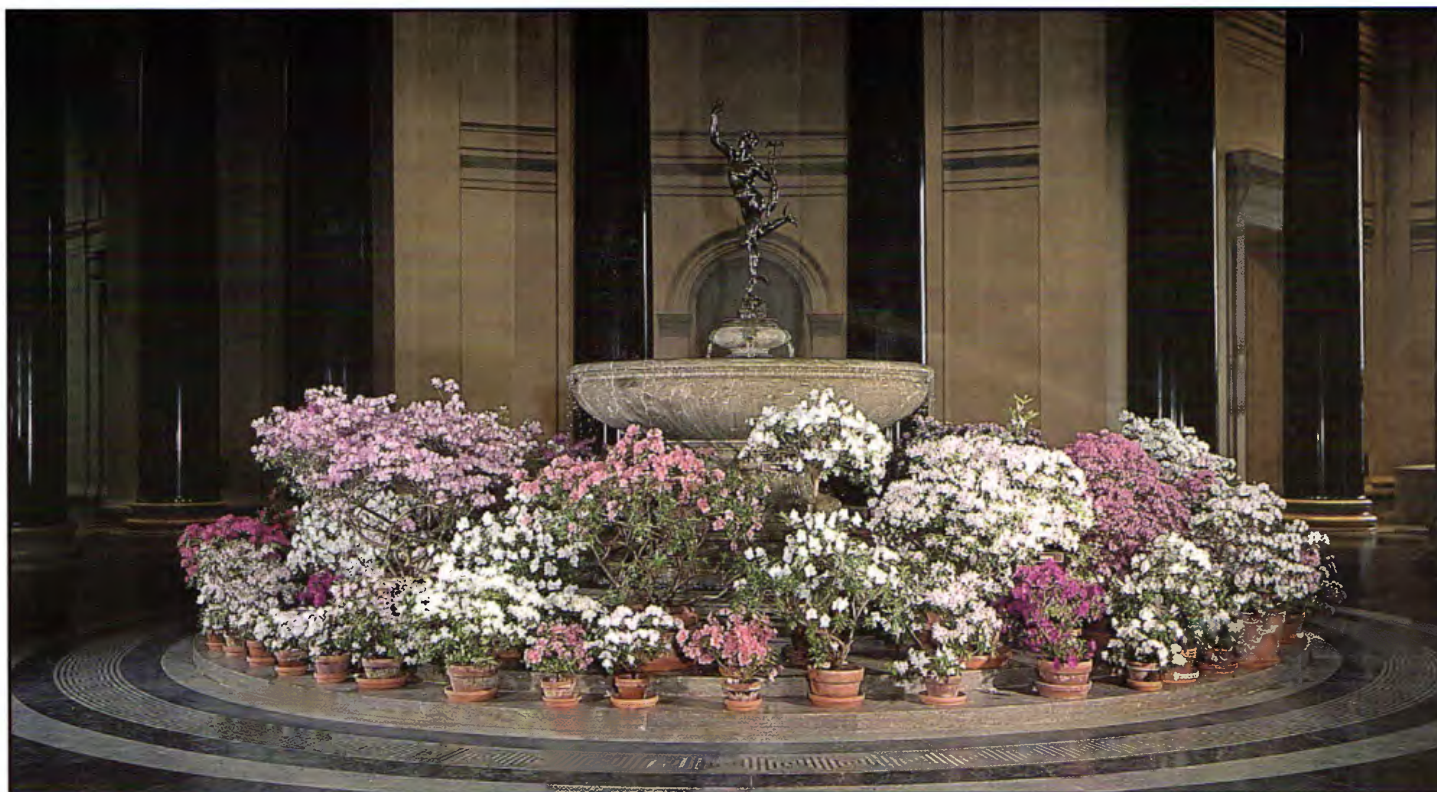
The Ames-Haskell Azalea Collection, West Building Rotunda, National Gallery of Art, Washington, D.C.