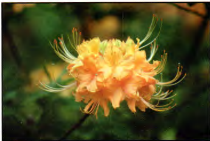
Another example of R. flammeum crossed with an Exbury hybrid. (Photo by Earl Sommerville)

A two-species cross, R. calendulaceum x R. flammeum . (Photo by Earl Sommerville)