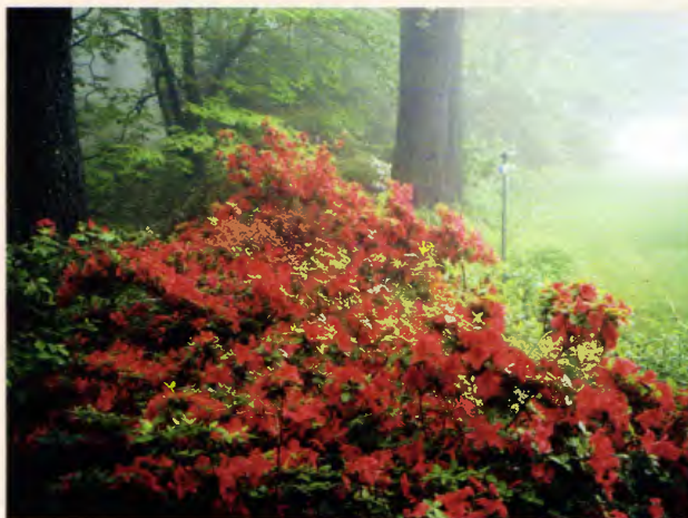
Azaleas in the morning mist at Frances Jones Garden.

We ask that all visitors to the gardens refrain from taking cuttings without asking the owners, although I am sure most would be happy to provide samples if asked. Restrooms will not be available at all the stops; therefore, take advantage of those situations where such facilities are available. Some light refreshments will be available at some stops.