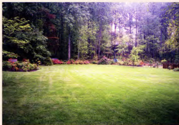
Jimmy and Ilona Wooten's garden has a border of azaleas and rhododendrons and a formal herb garden with perennials.

The Jimmy and Ilona Wooten Garden is located in the township of Walden and covers several acres of woodland and large expanses of open area. The Wootens' wonderful log home is delightfully landscaped and intimately connected to the woodland where many rhododendrons, azaleas, wildflowers, and exotic plants thrive. Perennial beds and a great herb garden punctuate the open grassy area that is bordered by large rhododendrons and a tree line.