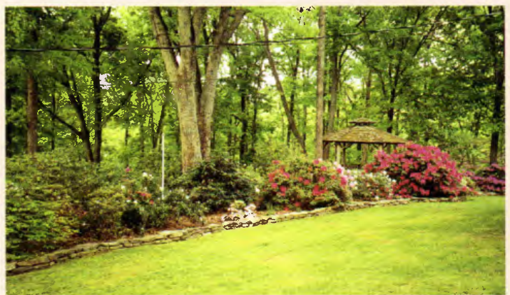
Rhododendrons and gazebo in the Vernon Carpenter Garden.

The Vernon Carpenter Garden is located on the eastern slope of Big Ridge about 400 feet above Lake Chickamauga. This garden is a true testament to hard work, for Vernon had difficult, cherty soil to work with. Hundreds of rhododendrons, azaleas, and wildflowers fill the landscaped grounds with wonderful color each