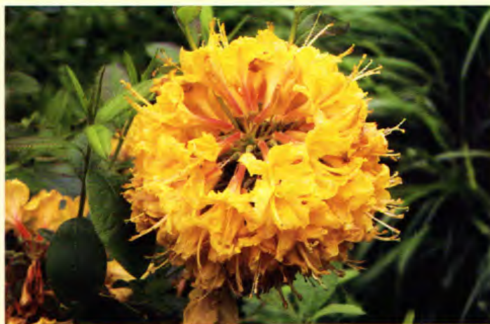
A Schild hybrid azalea (Ilam 'Primrose' x R. austrium ) crossed in 1992. This was among 255 seedlings, but it ended up in Jimmy Wooten's collection when given away at a chapter meeting.

The Joe and LaShon Schild Garden is located in Middle Valley, a bedroom community of Hixson. We have resided here since 1966, and it is also the location for my niche nursery that started as a hobby. This is perhaps the smallest garden we will see on the tours, but packed within it are exquisite examples of our native azaleas, Asian species, evergreen azaleas, rhododendrons, kalmias, and some of my hybrid azaleas. By my count, there are around 1500 shrubs in this "test garden," as I prefer to call it. Most are labeled for easy reference.