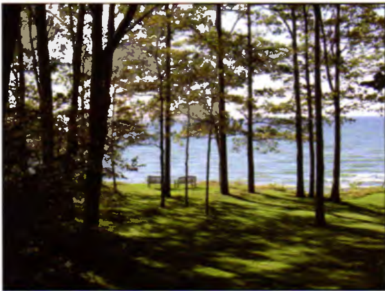
View of Lake Michigan from Wavecrest Nursery.

Our lunch stop will be at the home of Bruce and Carol Hop, which is located on the shore of Lake Michigan. We will enjoy a pig roast with all the trimmings. (A substitute box lunch can also be ordered through the hotel for those who don't like pork.) The Hop garden consists of many magnolias, dogwoods, and redbuds, along with 40-year old azaleas and rhododendrons.