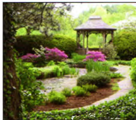
View of Hutchinson Garden.

maples, sitting amongst eastern white pines that were planted over 20 years ago.