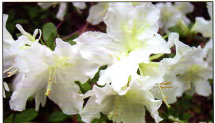
'Mrs LBJ', an evergreen azalea named to honor Mrs. Lyndon Baines Johnson on the occasion of her presenting the first B.Y. Morrison Memorial Lecture in 1968.