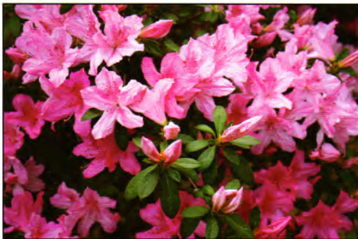
▲ 'Raspberry Parfait'

Twenty-five percent of the garden plantings came from ASA members. We have a special section of the garden called the Cultivar Evaluation Area in which we display and evaluate the performance of 216 cultivars. Some are numbered clones that breeders never got around to naming, some are from China, some are from climatic zones that we would not have expected to succeed in our Zone 8b weather, where our winter lows are rarely below 20°F. The following three examples show some of the more unusual cultivars bred in climates extremely different from ours.