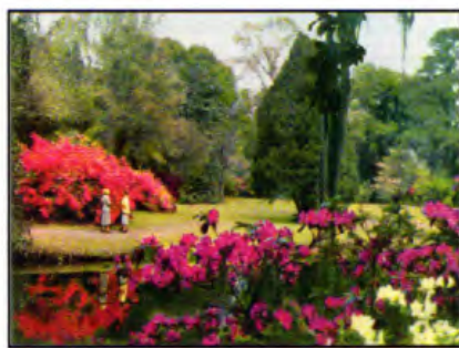
▲ The gardens 1907 ▼ The gardens 2009