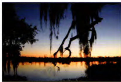
▲ Daybreak at Magnolia 2009 ▼ Artist's rendering 1907