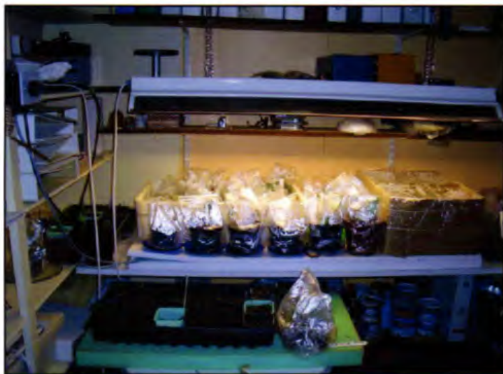
▲ Indoor light garden

mulates in the lower levels of a sphagnum bog. Harvesters of the horticultural peat moss remove the top few inches of the live sphagnum moss before harvesting the peat below. If you can't locate sphagnum, don't panic; you will still get fair germination without it.