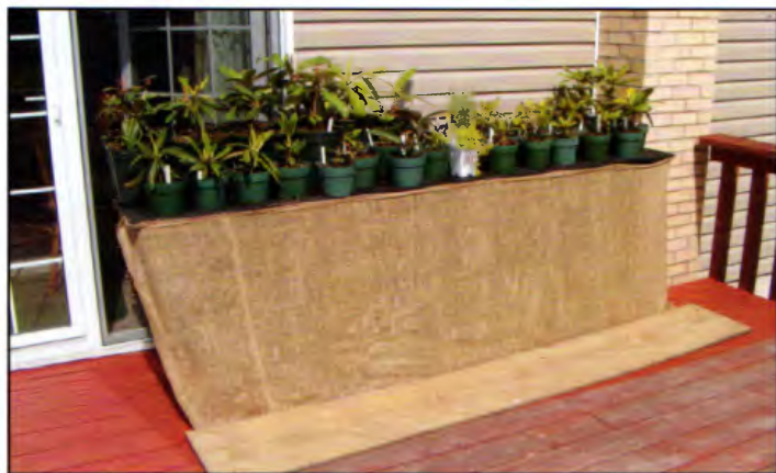
▲ ▼ Summer shading