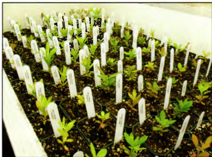
▲ Seedlings in early March

I water from the top, using three separate applicators for different stages of development. Watering includes the water soluble fertilizer as well. I water until a small pool first accumulates on the surface of the pot: