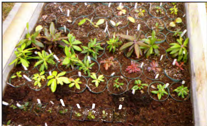
▲ ▼ Winter cold frame