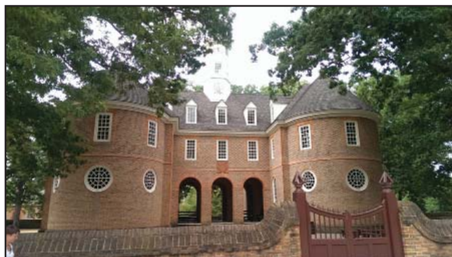
▲ House of Burgesses - Colonial Williamsburg

The ARS and ASA Boards of Directors will be meeting this day. For those not involved in these meetings, Wednesday is open for convention arrival and registration and for local touring. We will be offering tours of the colonial area