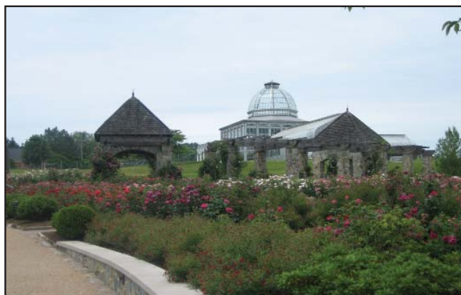
▼ Lewis Ginter Garden Conservatory