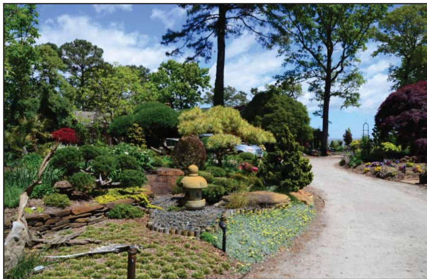
▲ Looking up the garden path in the Pinkham Garden.