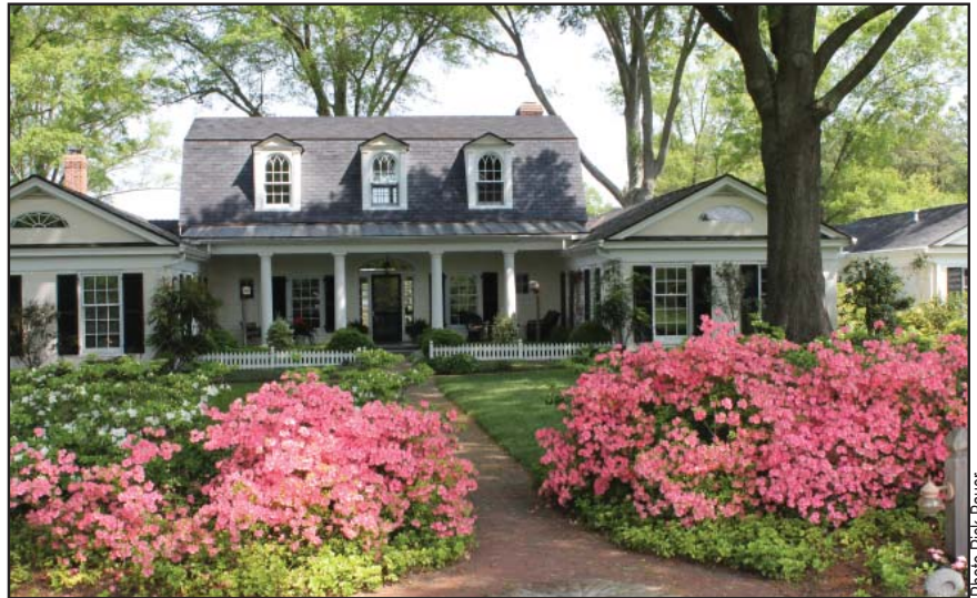
▲ Belle Terre - Perrin Garden