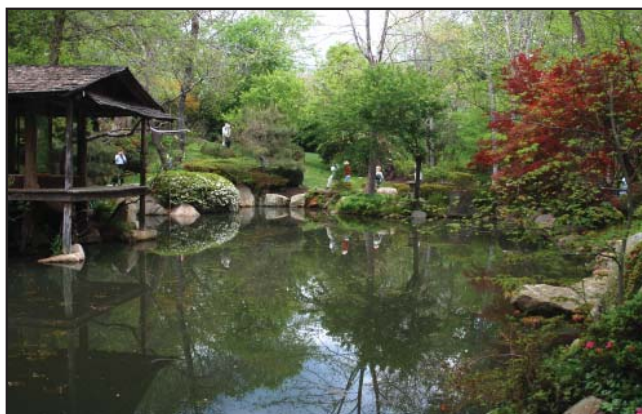
▼ Teahouse in Liesfeld Garden