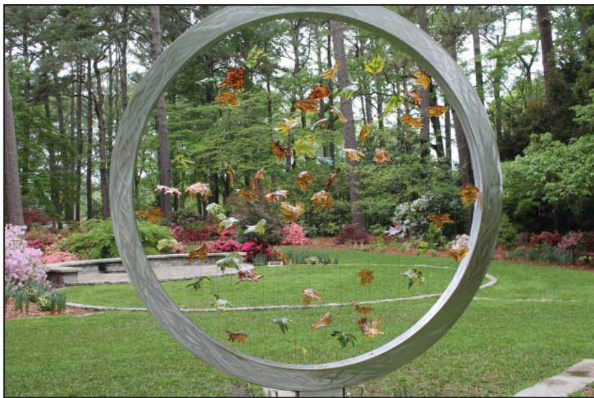
▼ Looking toward the McDonald Hybrid beds through a sculpture in the Reflection Garden.