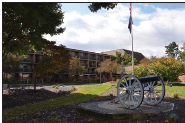
▼ Fort Magruder Hotel

and region, provided by the company Colonial Connections. The tours offered will be: