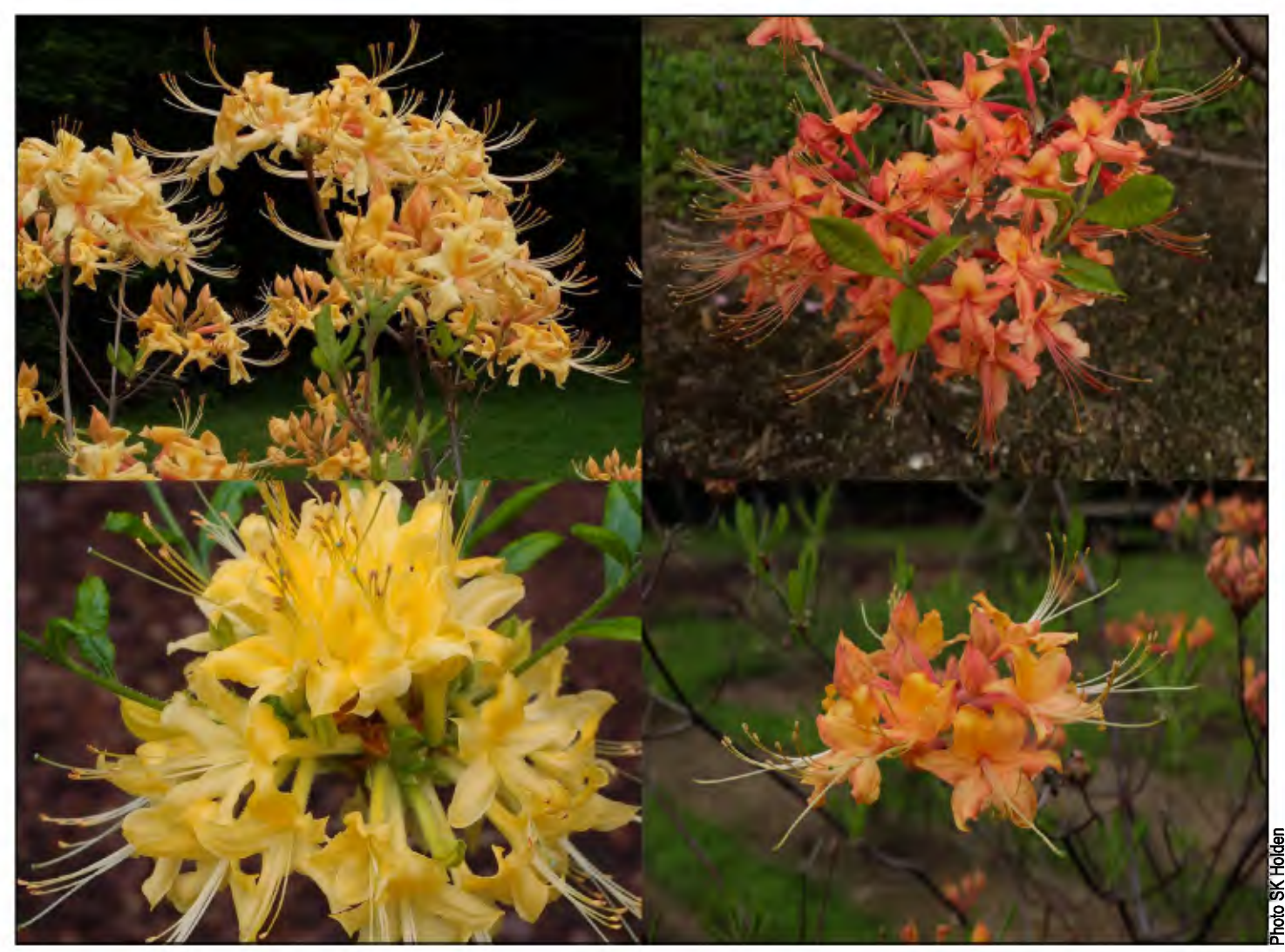
▼ Figure 1— R. austrinum accessions in bloom at the Leach Station, spring 2015

The native range of R. austrinum is fairly restricted, from northwest Florida into adjacent Georgia, Alabama, and southeast Mississippi. The species plants received from Natural Landscapes Nursery were grown from seed provided by Aaron Varnadoe, a grower of native azaleas who collected