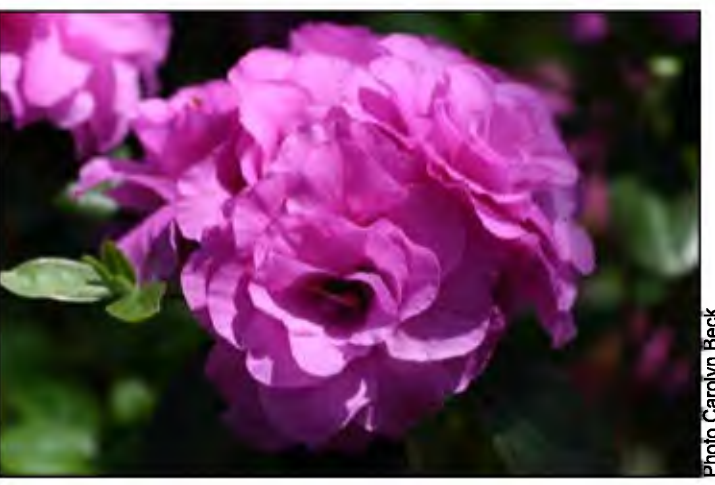
The Azalean / Spring 2020 • 5