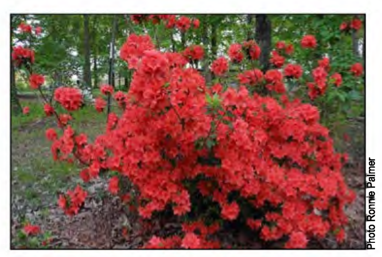
▲ Photo 6—Huang Azalea Hu 2-5-61 to be named 'David Drake'. This 20-year-old plant was dug, with permission, from the Auburn University Research Station at Camp Hill, AL.

Society members are encouraged to start their own private Legacy Gardens. Pick a given hybrid group and start collecting varieties. Many varieties of Legacy Hybrids are available at ASA convention plant sales, and we hope to make