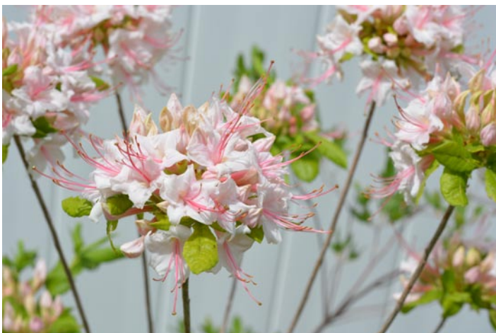
Photo 4. A typical triploid (3x) sibling of “Pleasant Progress” [( R. cumberlandense × R. viscosum ) (2x) × R. colemanii (4x)] showing the higher influence of R. colemanii .

fortuitous finding is a plant bred by the late Joe Parks of Dover, NH, called simply, “Park’s Deep Pink” (See Photo 5). “Park’s Deep Pink” is a seed fertile triploid deciduous azalea, producing seed when crossed with both diploids and tetraploids. When “Park’s Deep Pink” is crossed with a diploid producing seedpods the flow cytometry testing of the seeds shows that there is a mix of diploid, triploid, and tetraploid seeds. To date, only a few long-term viable seedlings have been produced from the diploid crosses. Using flow cytometry, we have been able to document that seedlings from “Park’s Deep Pink” X tetraploid tested in a range from triploid, tetraploid, aneuploid (an abnormal number of chromosomes between triploid and tetraploid), and occasionally pentaploids (5X). Our hybrid “Canobie Conundrum” (See Photo 6.) is the tetraploid pollen parent used in hybridizing with “Park’s Deep Pink” to produce seedlings of different ploidy levels.