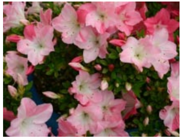
Figure 6. ‘Juko’, one of the most influential Satsuki varieties. Relatively fast-growing with small, dark green leaves but relatively large flowers. Used in plant breeding to produce new types of flowers specifically with softer pastel colors.

Like ‘Suisen’, ‘Juko’ also has many sports with ‘Karenko’ being one of the most popular. ‘Karenko’ is a two-color sport of ‘Juko’. ‘Byakuren’ is a white-base flower sport of ‘Karenko’. Several new varieties were obtained as the result of crossing ‘Koyo’ with either ‘Karenko’ or ‘Byakuren’. One of these varieties is ‘Shinsei’, which is very similar to ‘Meisui’ (figure 8). ‘Shinsei’ is the result of a cross of ‘Koyo’ with ‘Byakuren’. Its flowers