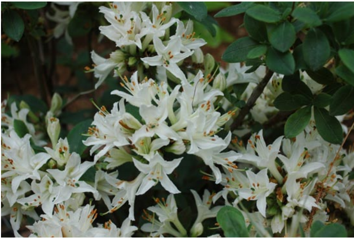
Photo 8. 'Fragrant Star' (8x), the octoploid, chemically created from R. atlanticum 'Snowbird' (4x).