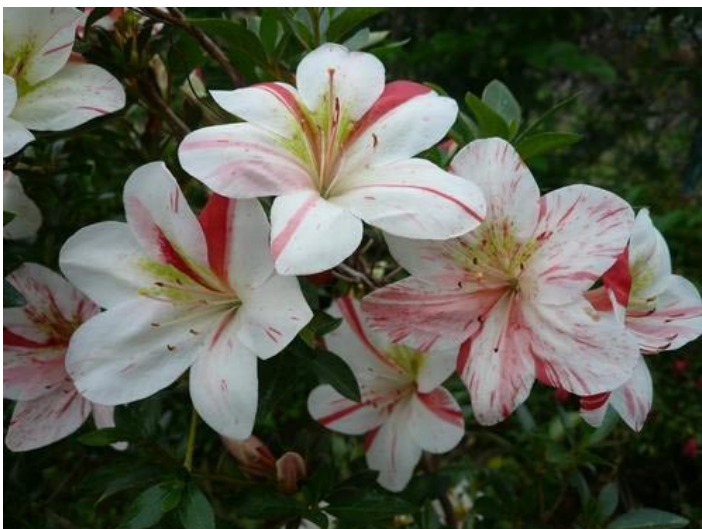
Figure 12. 'Saishun', cross between 'Suisen' and 'Asuka'. Vivid contrast between white background, red stripes and yellowish blotch.

'Suisen' with 'Asuka' while 'Suika' was produced from 'Asuka' x 'Suisen'.