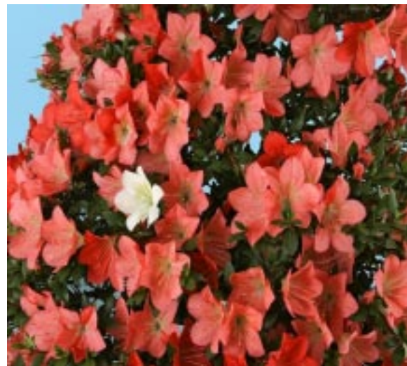
Figure 4. ‘Koyo’, a sport of ‘Suisen’ with mainly solid red flowers.

While ‘Suisen’ is definitely very attractive-looking, this in itself does not fully explain the success of ‘Suisen’ as a breeding parent. I believe that the key to ‘Suisen’ is that it has tetraploid gametes. 4 Let me explain. Evergreen azaleas usually carry two pairs of chromosomes, just like us humans. However, in some types of plants it is fairly common for each cell to contain more than just two copies of their entire genetic code. This is referred to as polyploidy. The more copies of the genome there are in each cell, the larger the cell has to be. And larger cells lead to thicker tissues and larger flowers. This is often desirable in plants—both for food crops and for ornamentals. Larger flowers and especially thicker, and thus more durable, petals are very desirable traits in azaleas. It turns out that especially triploids, where there are three copies of each chromosome, usually have the best ornamental traits. Diploid azaleas have 26 chromosomes i.e. 13 pairs. 5 Therefore, triploids have 39 chromosomes and tetraploids have 52. Triploid flowers are usually larger and thicker petals compared to tetraploids. Furthermore, triploid plants usually have impaired fertility, which seems to enhance bloom