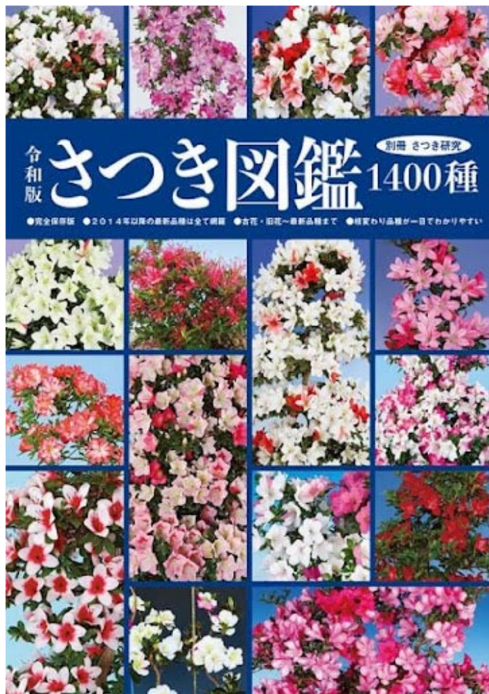
Figure 1. Japanese 2020 Satsuki dictionary containing 1,400 varieties, released by Tochinoha Shobo and available on Amazon.co.jp.

As a European, I look with a bit of envy at the popularity of evergreen azaleas in both Japan and North America. Yes, evergreen azaleas have a long history here and European plant breeders also produced some excellent varieties. However, most of them are small-flowering Kurume-type varieties, ideal for landscaping purposes. A few nurseries here in Europe are still breeding new varieties. But it feels as if this does not compare to the richness found in North America. And certainly not compared to the recent hybridization efforts in Japan. My main interest is in Satsuki azaleas, both for their attractive foliage and their multi-colored patterned flowers. Satsuki