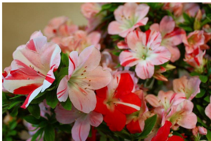
Figure 13. 'Aika', pink sport of 'Meguriai' known for the different shades of pinks and reds.

Beyond crosses with 'Juko', 'Asuka', and their sports, the following are some other noteworthy offspring of 'Suisen'. Together with 'Kogetsu', it has produced 'Meguriai'. 'Kogetsu' is among the most famous red-white mix multi-colored Satsuki. Few varieties can beat a good 'Kogetsu' in terms of richness in flower patterns. 'Meguriai' seems to be one of the most common 'Suisen' offspring around. I think it is available in the US. 'Aika' is the pink jiai sport of 'Meguriai', which is arguably even more attractive (figure 13).