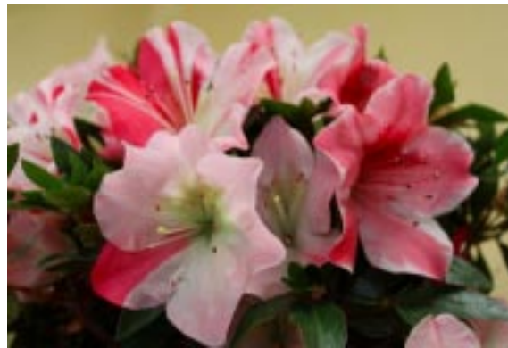
Figure 7. ‘Meisui’, cross between ‘Suisen’ and ‘Juko’.