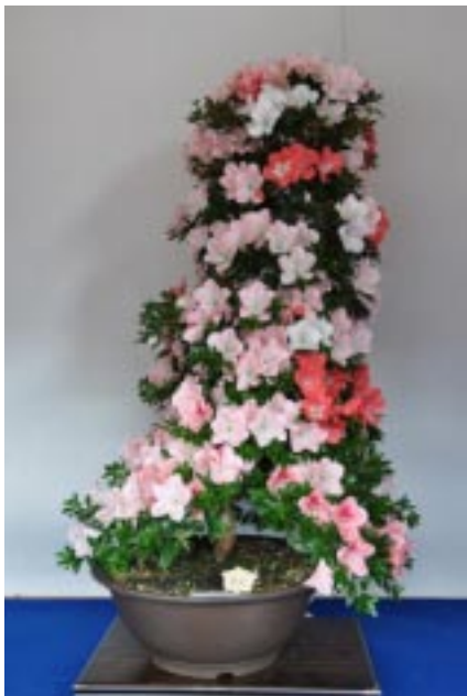
Figure 2. 'Aika', award winner in the meika class at the 2014 Kanuma Satsuki Festival.

In contrast, there are the flower display Satsuki exhibitions (figure 2). Very often, these Satsuki are styled as meika (銘花, meaning: famous flower) trees. These are tall potted single-trunked conical-shaped azalea plants, sometimes with S-shaped curves, and somewhat resembling a Christmas tree. The