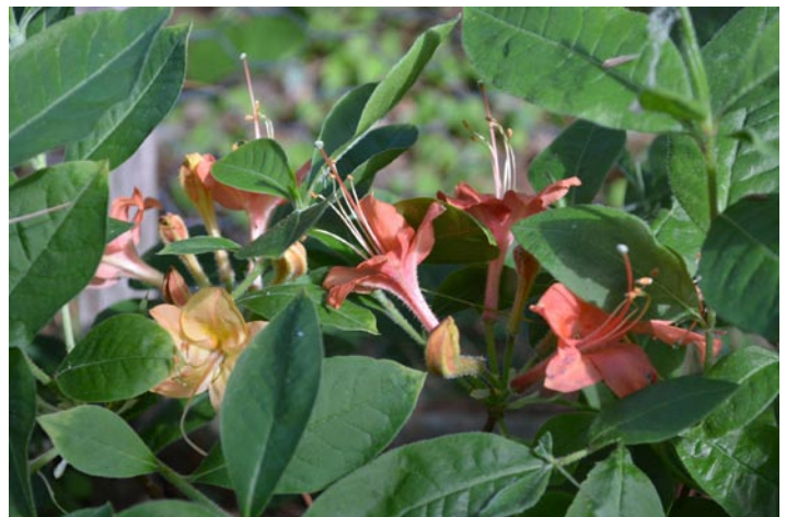
Photo 7. An example of a pentaploid (5x) seedling of "Park's Deep Pink" (3x) × "Canobie Conundrum" (4x)