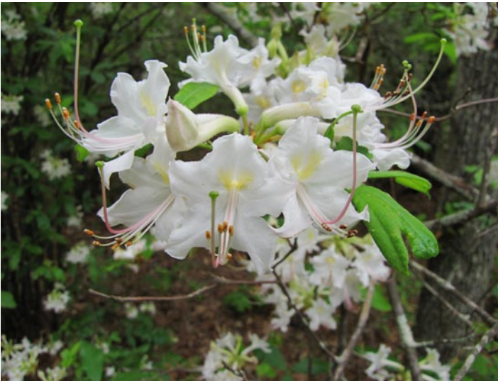
Photo 3. R. colemanii (4x), the tetraploid pollen parent of “Pleasant Progress” (4x).