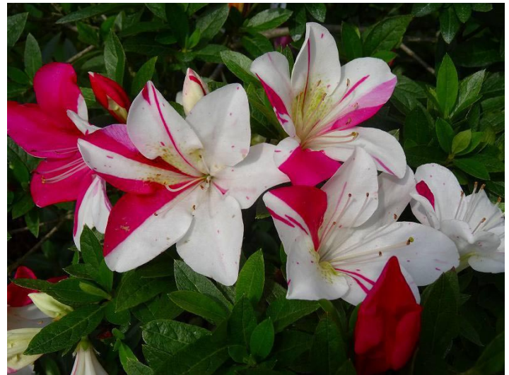
Figure 15. 'Sanshimai', sport of 'Moeka' is known for the more vivid carmine red stripes.