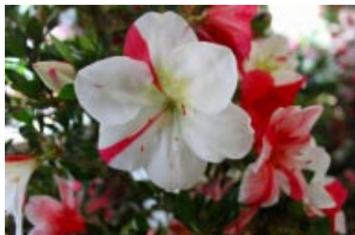
Figure 11. 'Suika', cross between 'Asuka' and 'Suisen'. Petals overlap makes the flower appear more organic.