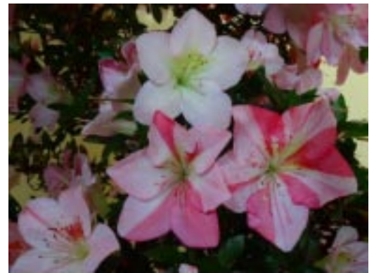
Figure 8. ‘Shinsei’, cross between ‘Koyo’ and ‘Byakuren’.

are slightly smaller than ‘Meisui’, but it makes up for this through its pastel colors and elegant patterns. Another variety I want to briefly mention is ‘Sachi-no-kagayaki’, which has white centers, and usually 6 or 7 petals that are rather pointy. Besides ‘Suisen’ and ‘Juko’, ‘Asuka’ is another more recent and very influential Satsuki variety. It is known for the deeper purple color, large flowers, with narrow but somewhat blunt-tipped petals. ‘Asuka’ has produced plenty of sports and seedlings, which is beyond the scope of this article. The variety ‘Saishun’ was obtained by crossing