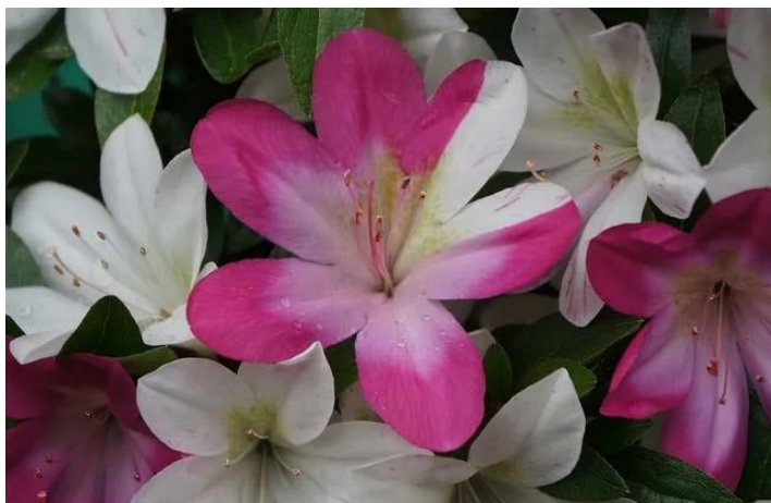
Figure 9. 'Asuka', cross between 'Gekkeikan' x 'Shunsui'. Rounded.