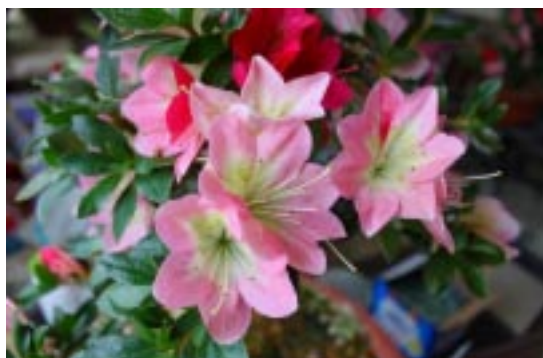
Figure 10. 'Sachi-no-kagayaki', cross between 'Miharu' and 'Karenko'. Six or seven pointy petals.