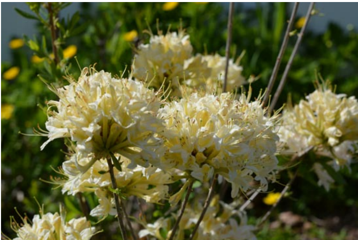
Photo 9. "Pleasant Pathway" (6x), a hexaploid result from 'Chickasaw' (4x) × 'Fragrant Star' (8x).