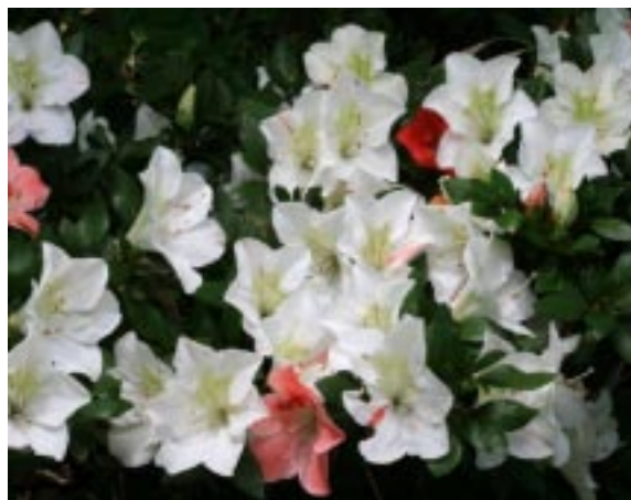
Figure 5. ‘Suisen’, the most popular breeding parent among modern Satsuki azaleas.

times since flowers usually fade after fertilization has occurred. Gartrell used the tetraploid ‘Gettoku’ (‘Getsutoku’) with great success in producing some excellent Robin Hill Azaleas. 6 Why is ‘Suisen’ special? There have been many earlier tetraploid Satsuki. One reason may be the smooth neater flower shape of ‘Suisen’ over ruffled ( namiuchi , 波打) flowers like ‘Gettoku’ and its Robin Hill offspring. Many old Satsuki cultivars have ruffled flowers. Some are ‘Asahi-no-hikari’, ‘Gyoten’, or ‘Gumpo’. But almost none of the new cultivars registered in Japan have this trait. Smooth, neat flowers seem to be in fashion today among the Japanese Satsuki crowd. This matches the “changing fashion” as explained by Jim Trumbly in his Summer 2001 article in The Azalean .