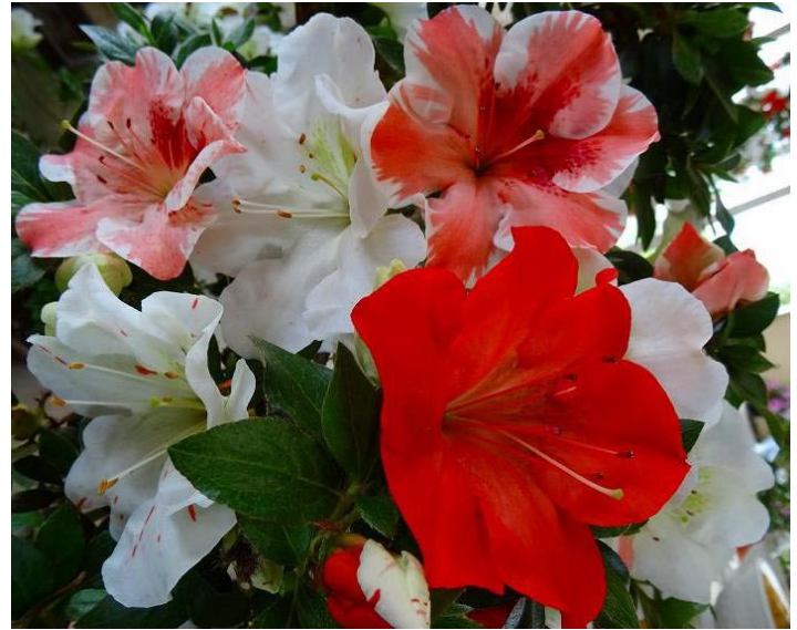
Figure 17. 'Seiten', a cross between 'Suisen' and 'Gyoko' has very large (> 4") flowers.

tion here in this article. The flowers of 'Seiten' do have more substance to them than even 'Hilda Niblett', the Robin Hill, or 'Haru-no-sono'.