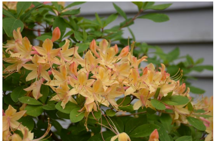
Photo 6. "Canobie Conundrum" ('My Mary' (4x) × 'Marydel' (4x)) is the tetraploid pollen parent used in hybridizing with "Park's Deep Pink" (3x) to produce seedlings of different ploidy levels.