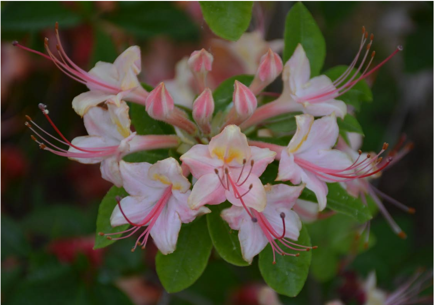
Photo 1. “Pleasant Progress” (4x), a tetraploid resulting from diploid × tetraploid interaction [( R. cumberlandense (2x) × R. viscosum (2x)) (2x) × R. colemanii (4x)].

This direct interaction between diploid and tetraploid species is not bidirectional but has been shown to be one way. As shown in the Table of Ploidy Interactions (page 43), when the diploid species is the seed parent and tetraploid species is the pollen parent the result is viable seedlings. The blooms of these seedlings exhibit more of the tetraploid species characteristics. Flow cytometry has confirmed that the great majority of such