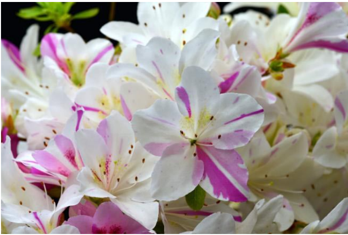
Figure 14. Moeka', cross between 'Suisen' and 'Ai no tsuki' is now a very popular and easy to grow variety.