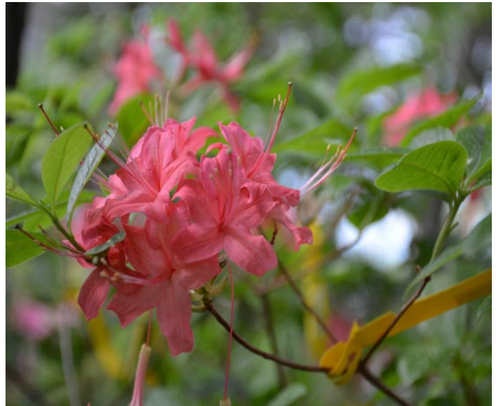
Photo 5. "Park's Deep Pink" (3x), a seed fertile triploid deciduous azalea.

We have demonstrated that fertile pentaploids can be produced via a triploid pathway or a hexaploid pathway. We will continue this work by looking at flow cytometry of fertile pentaploids offspring. Planned future hand crosses will explore the diploids interaction with pentaploids.