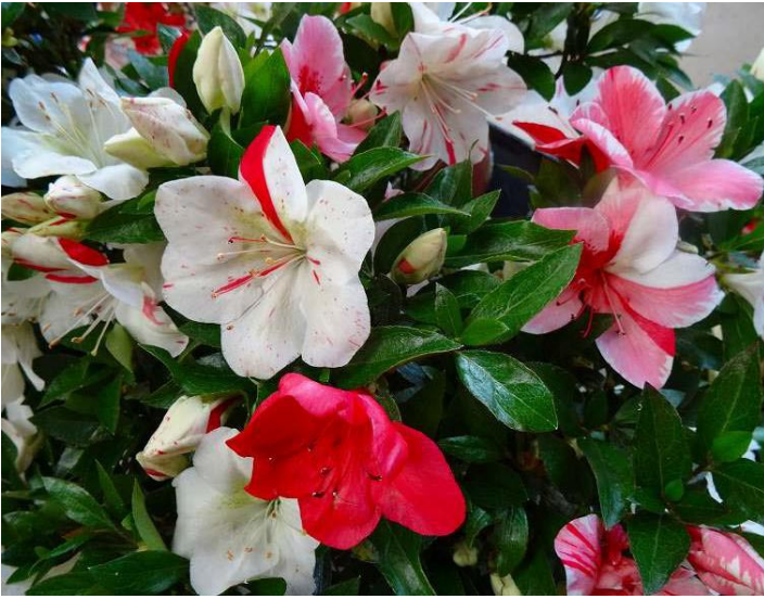
Figure 16. 'Satsukibare', cross between 'Suisen' and 'Reiko'. Note the large number of tiny red spots.