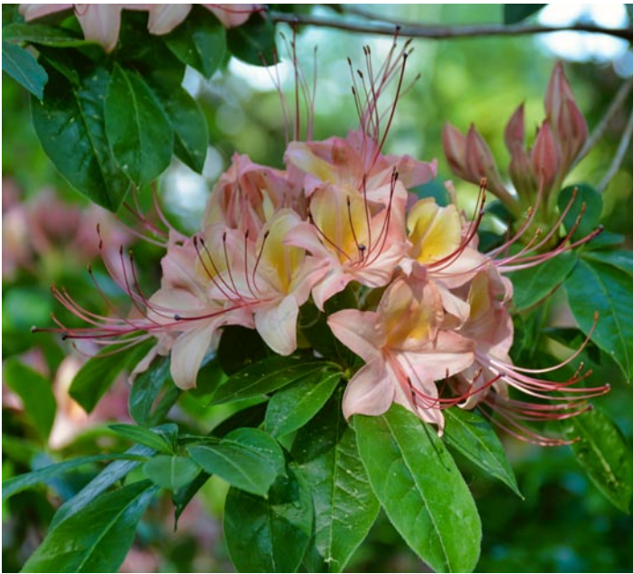
Photo 2. ( R. cumberlandense × R. viscosum ) (2x). The diploid seed parent of “Pleasant Progress” (4x).