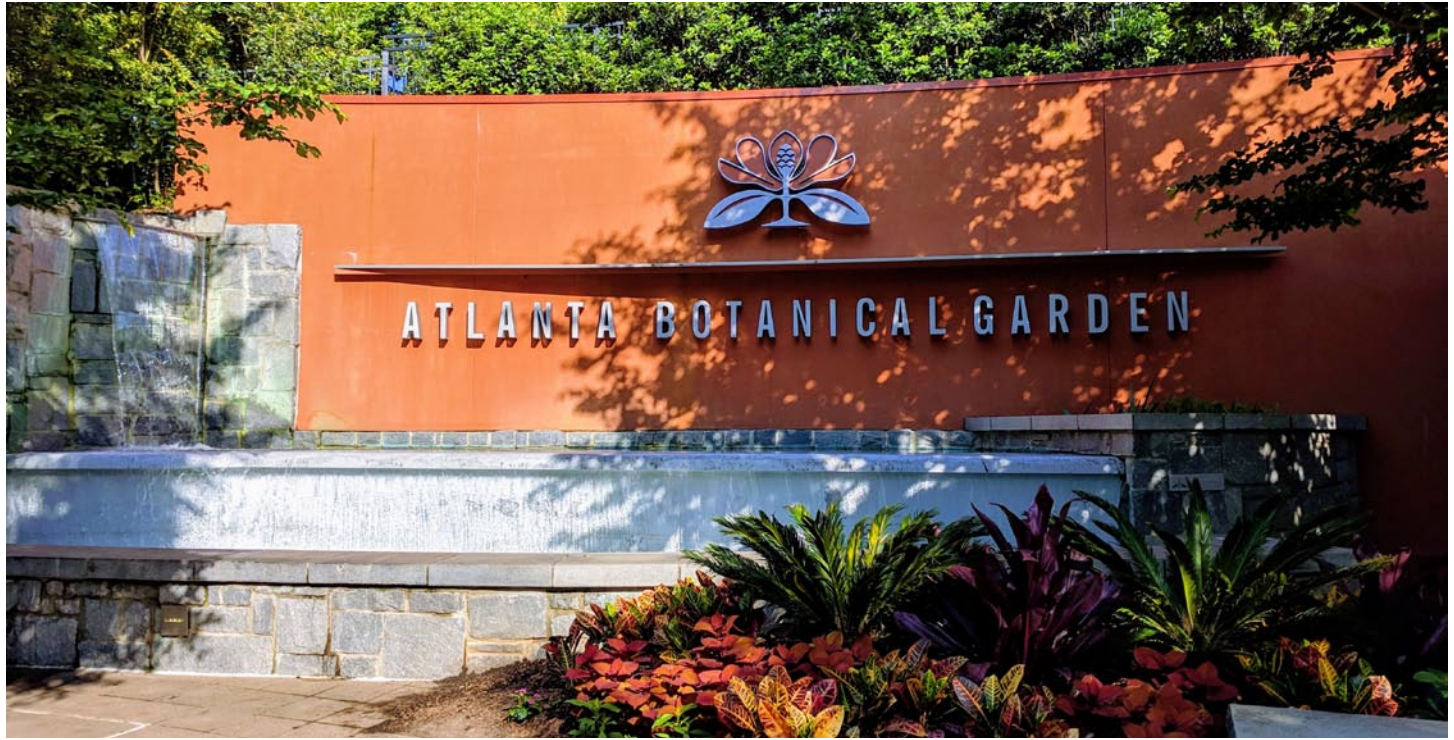
Entrance to the Atlanta Botanical Gardens.

style home known as BabyLand General® Hospital where you can learn the history of the Appalachian craft that inspired the cabbage patch. Xavier has been hybridizing azaleas from seed for over a decade with the goal of producing a garden with many unique varieties.