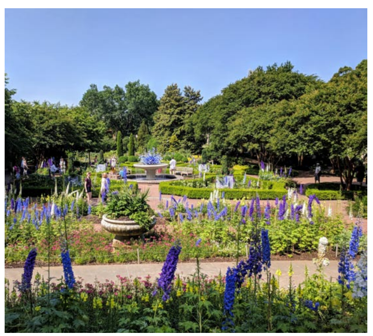
Atlanta Botanical Garden.